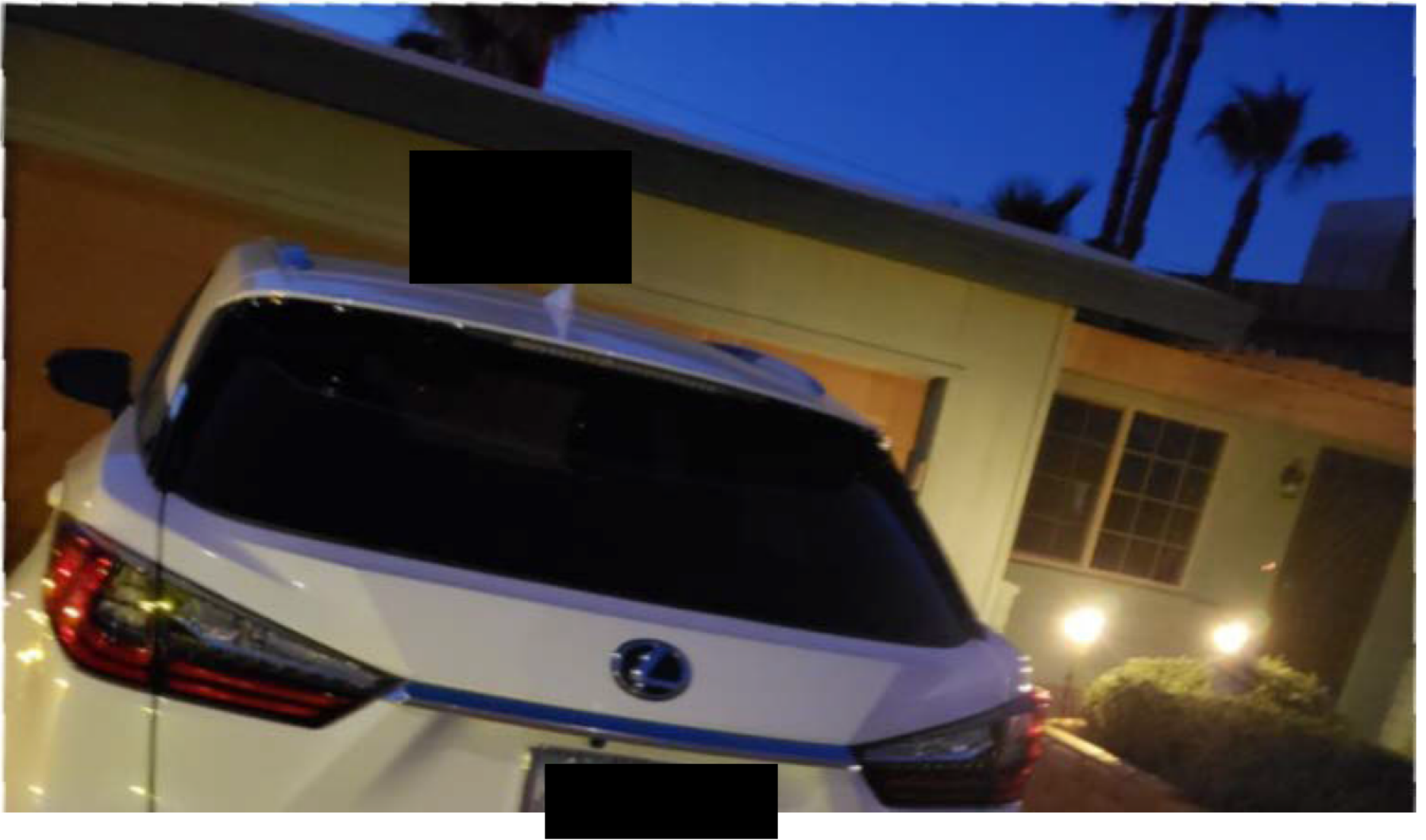
Exhibit 2 - Attempted Service 8/12/21